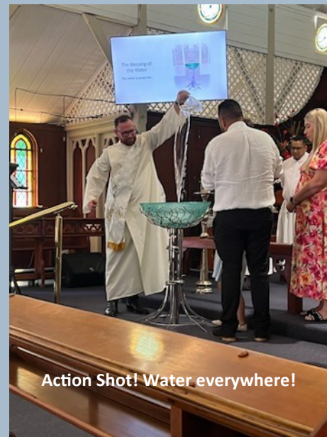
Action Shot! Water everywhere!