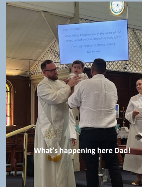
What's happening here Dad!